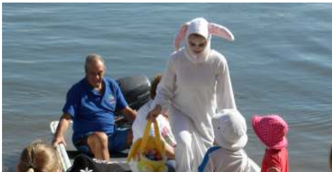
Easter Bunny 2011